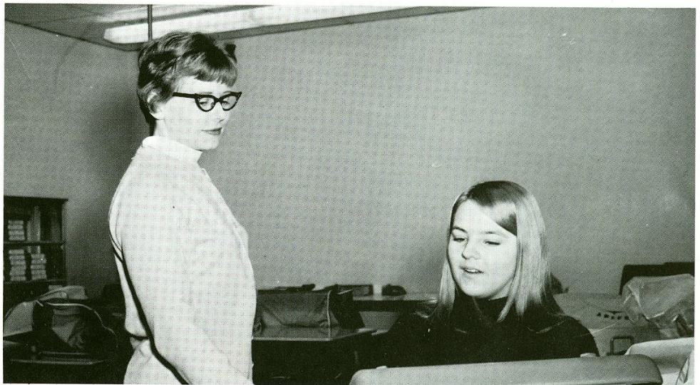
Miss Fossen, Office Machines, Office Practice. "Yes, that machine came complete with an on-off button."