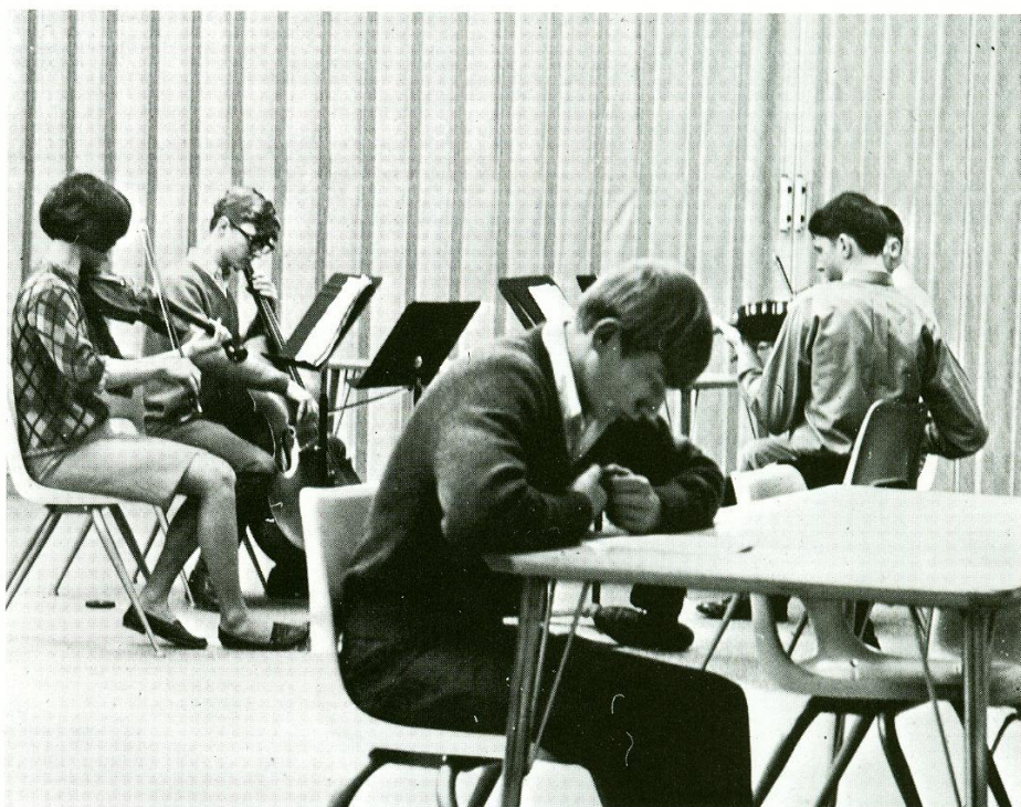
A quartet accompanies the studying of the Enlightenment