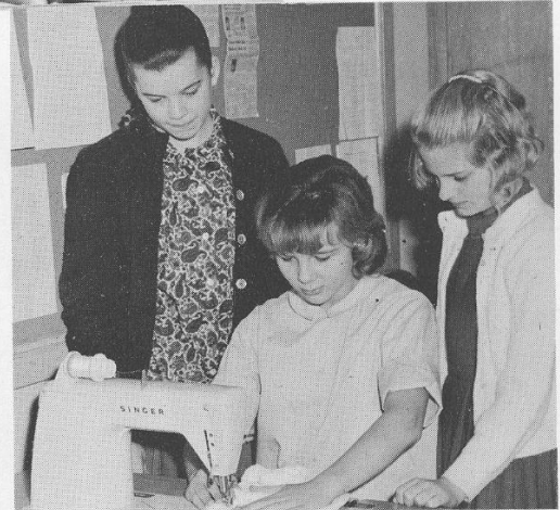
A STITCH IN TIME SAVES NINE