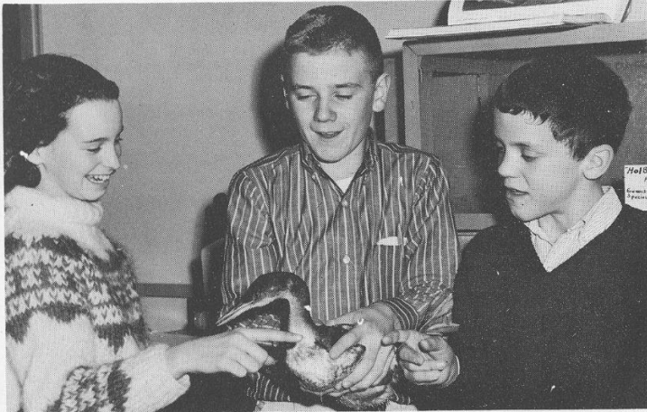
WHAT IS IT?