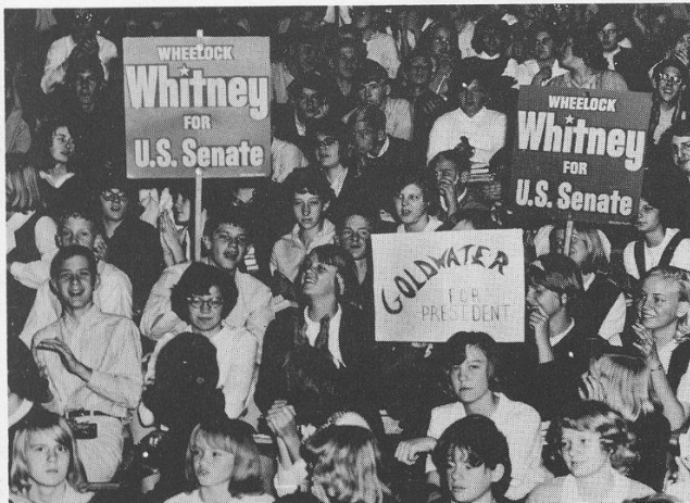
DEMOCRACY IN ACTION