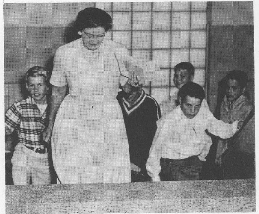
THE PILGRIMS LAND AGAIN