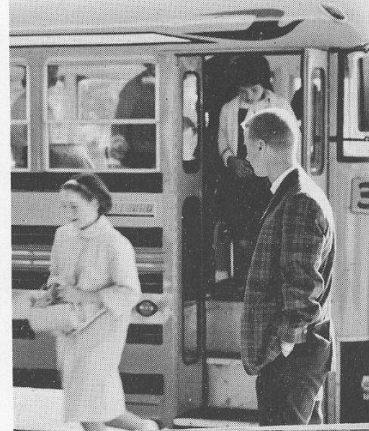
WHO IS HE AFTER NOW?