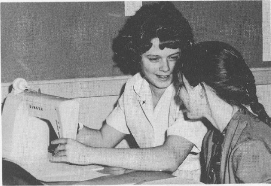
WATCH YOUR FINGERS